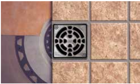
Schluter®-KERDI-DRAIN assembly with Schluter®-KERDI waterproofing membrane.

Procedure E at 90% relative humidity. KERDI-DS is 20-mil thick and features additives to produce a water vapor permeance of 0.19 perms.