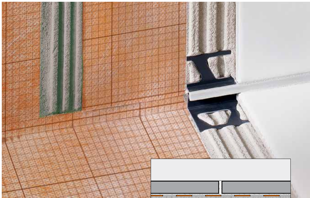
8.1 Schluter®-KERDI 8.1 Schluter®-KERDI-DS

Preformed, seamless corners include the following. KERDI-KERECK-F are used to seal 90° inside and outside corners. KERDI-