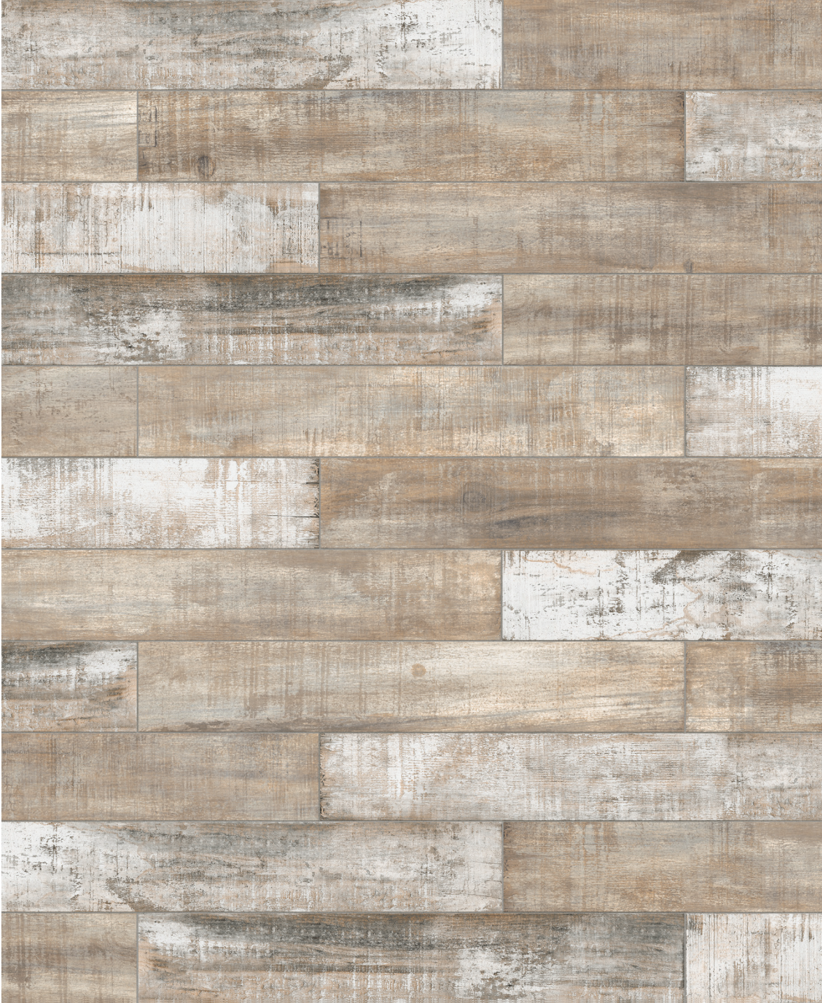
6" x 36" MUSKOKA SADDLE HD PORCELAIN TILE