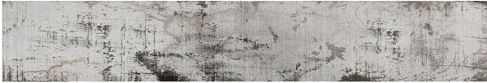
6" x 36" MUSKOKA SMOKE HD PORCELAIN TILE 4500-0449-0