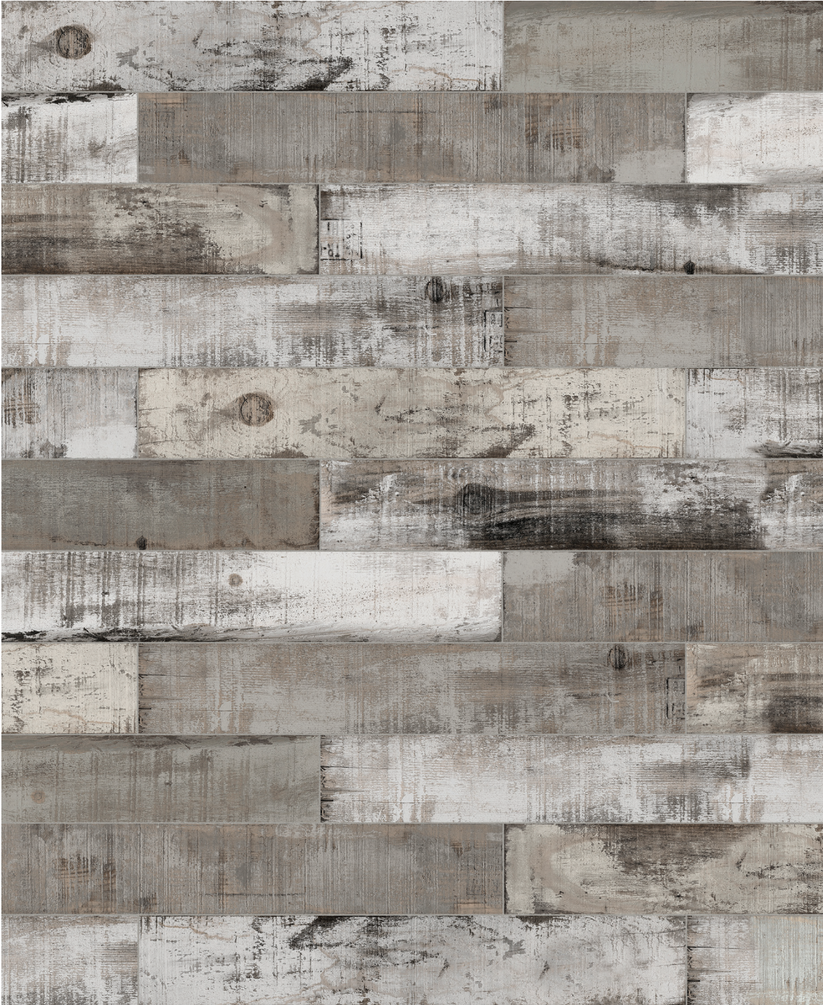
6" x 36" MUSKOKA SMOKE HD PORCELAIN TILE