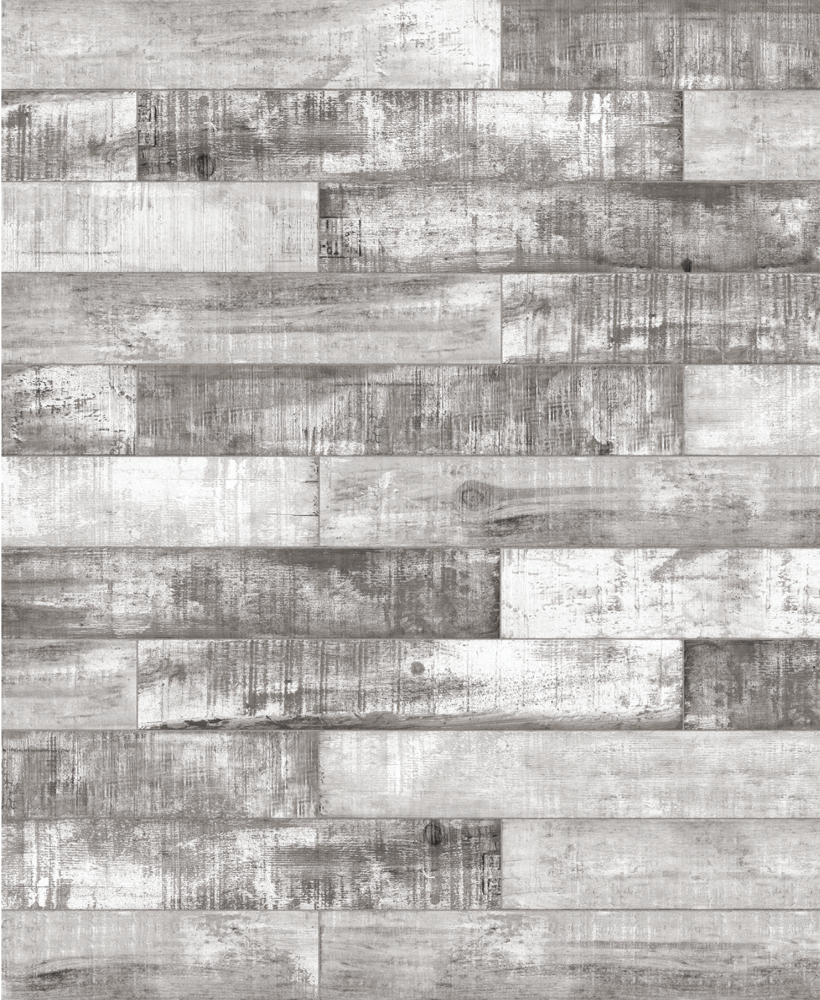
6" x 36" MUSKOKA ASH HD PORCELAIN TILE