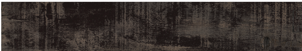
6" x 36" MUSKOKA CHARRED HD PORCELAIN TILE 4500-0447-0