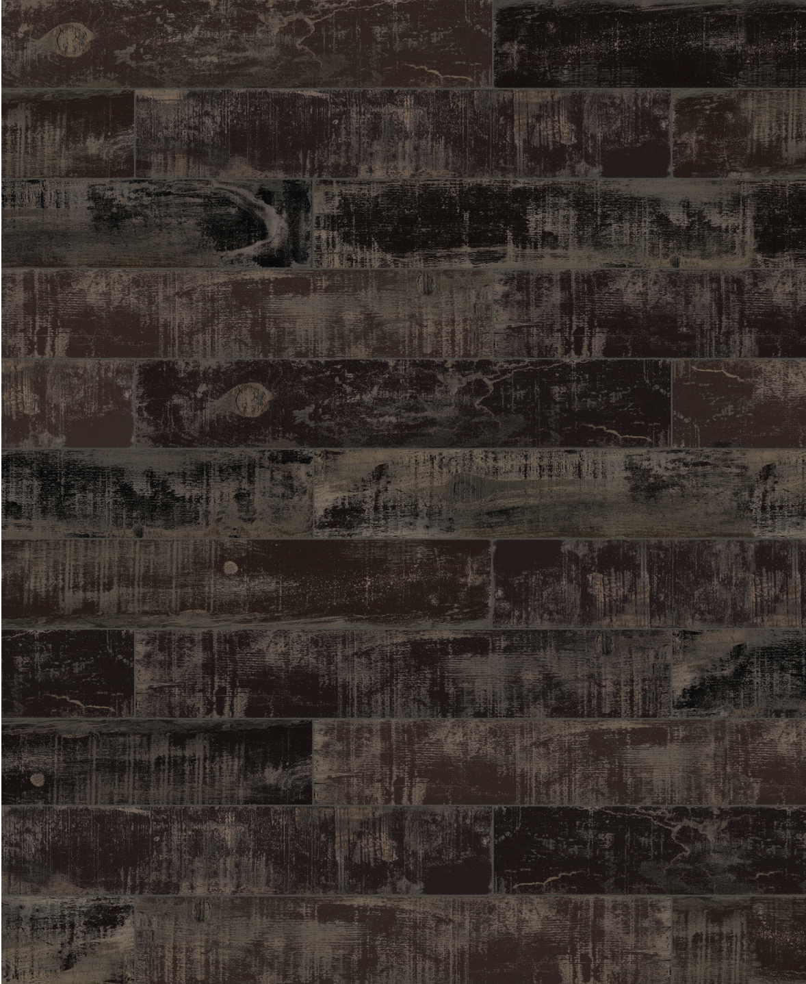
6" x 36" MUSKOKA CHARRED HD PORCELAIN TILE