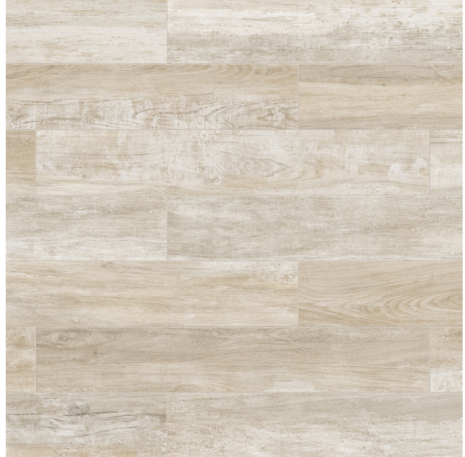
6 x 36 in / 15 x 90 cm image variations

8x48 in / 20x120 cm Actual: 200x1200x10,7 mm 44 images