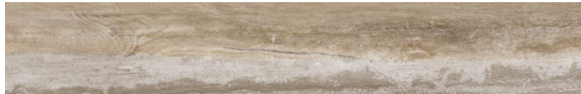
6 x 36 in / 15 x 90 cm Rectified Matte 4500-0111-0