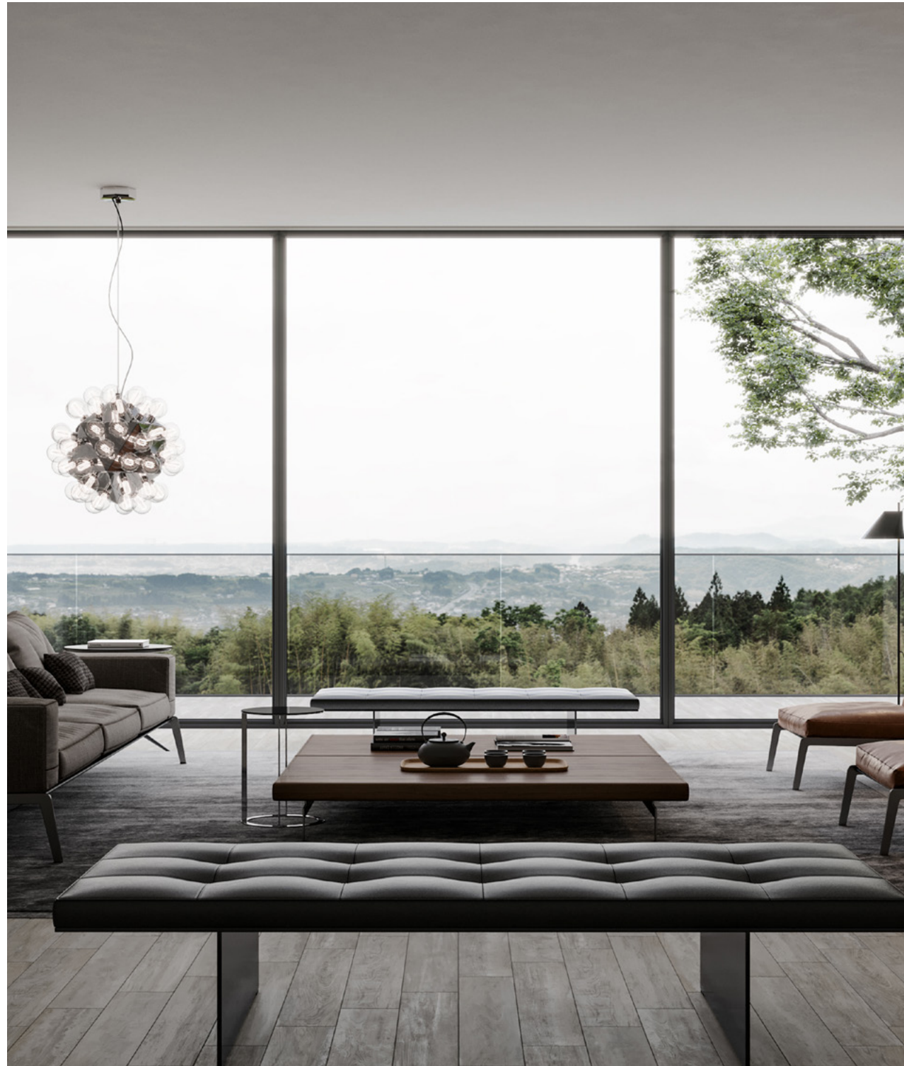
6 x 36 in / 15 x 90 cm Cabin Cypress Matte Rectified Glazed Porcelain Tile