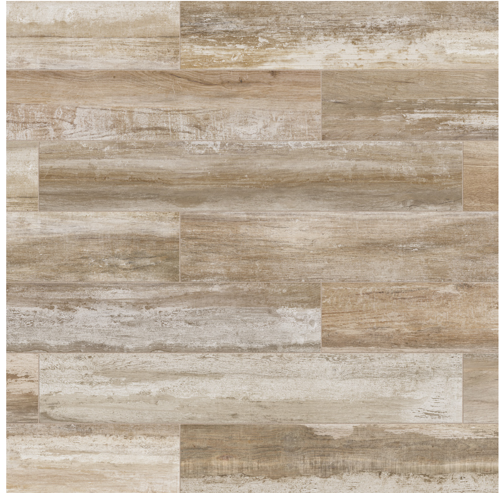
6 x 36 in / 15 x 90 cm image variations

8x48 in / 20x120 cm Actual: 200x1200x10,7 mm 44 images