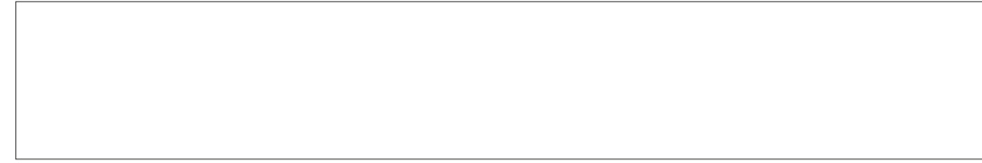
8 x 48 in / 20 x 120 cm Rectified Matte