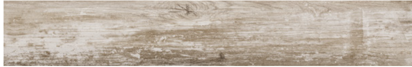
6 x 36 in / 15 x 90 cm Rectified Matte 4500-0107-0