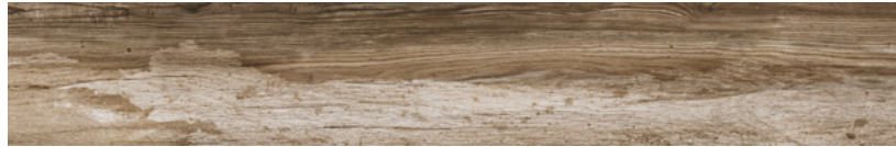
6 x 36 in / 15 x 90 cm Rectified Matte 4500-0105-0