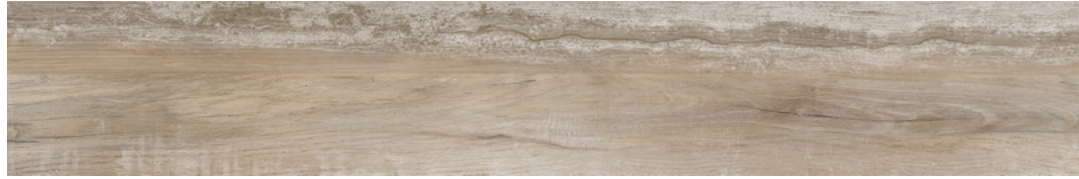
8 x 48 in / 20 x 120 cm Rectified Matte 4500-0112-0