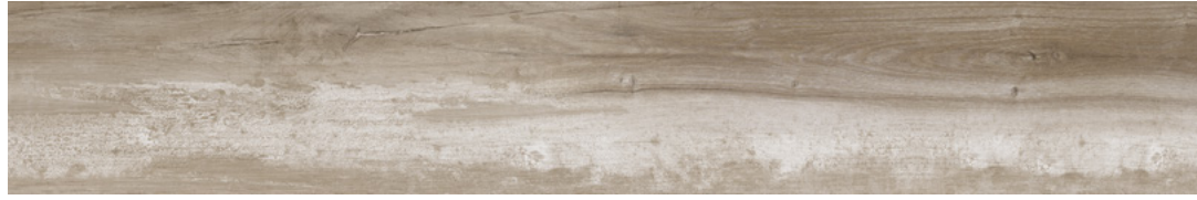
8 x 48 in / 20 x 120 cm Rectified Matte 4500-0108-0