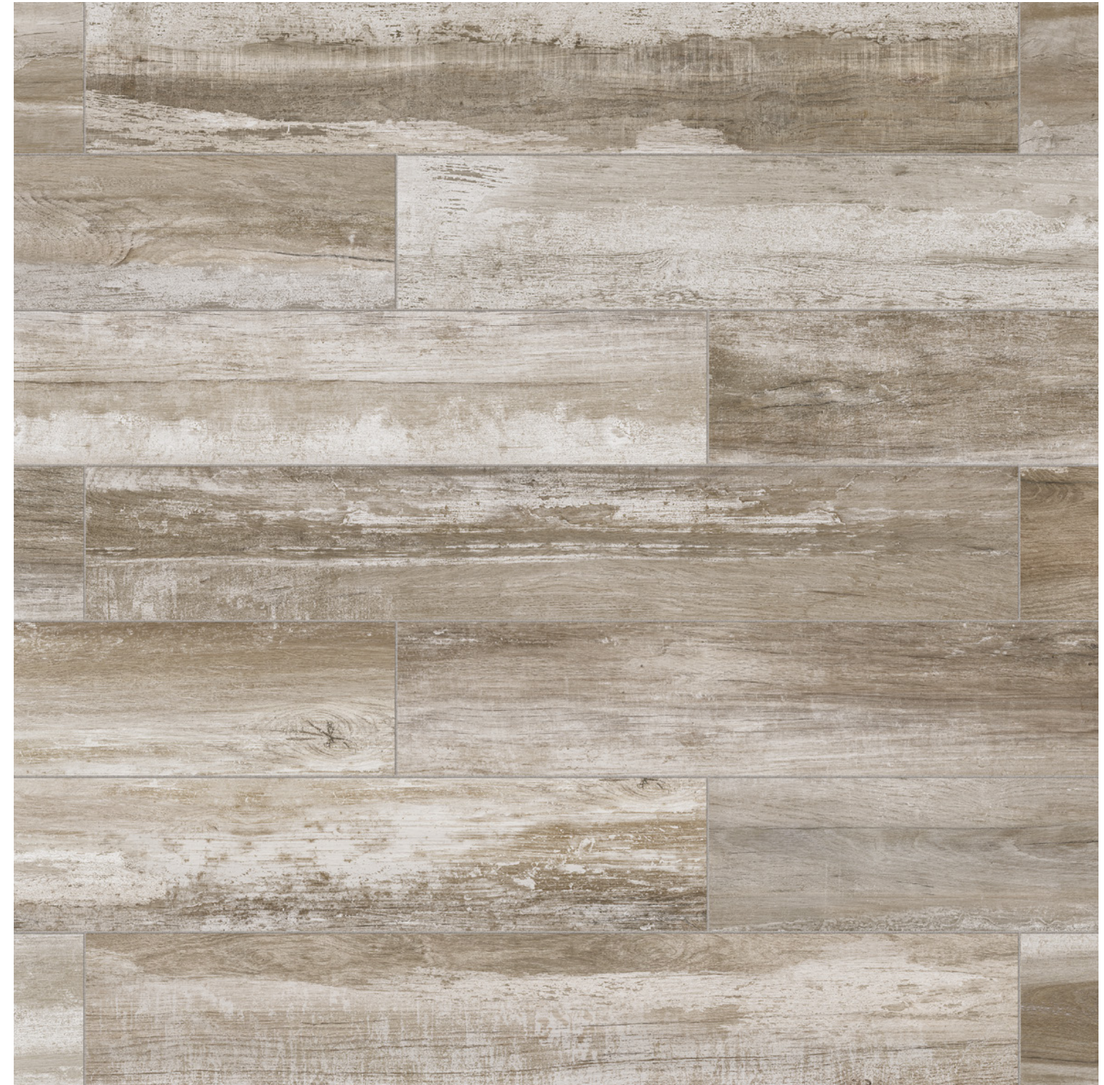
6 x 36 in / 15 x 90 cm image variations

8x48 in / 20x120 cm Actual: 200x1200x10,7 mm 44 images