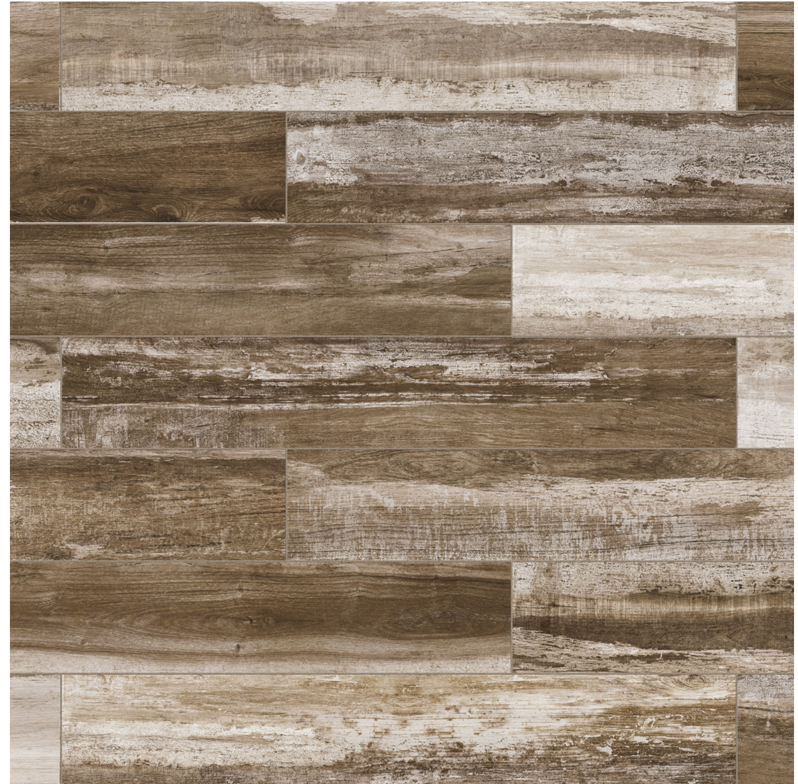
6 x 36 in / 15 x 90 cm image variations

8x48 in / 20x120 cm Actual: 200x1200x10,7 mm 44 images