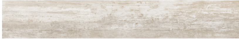
6 x 36 in / 15 x 90 cm Rectified Matte 4500-0109-0