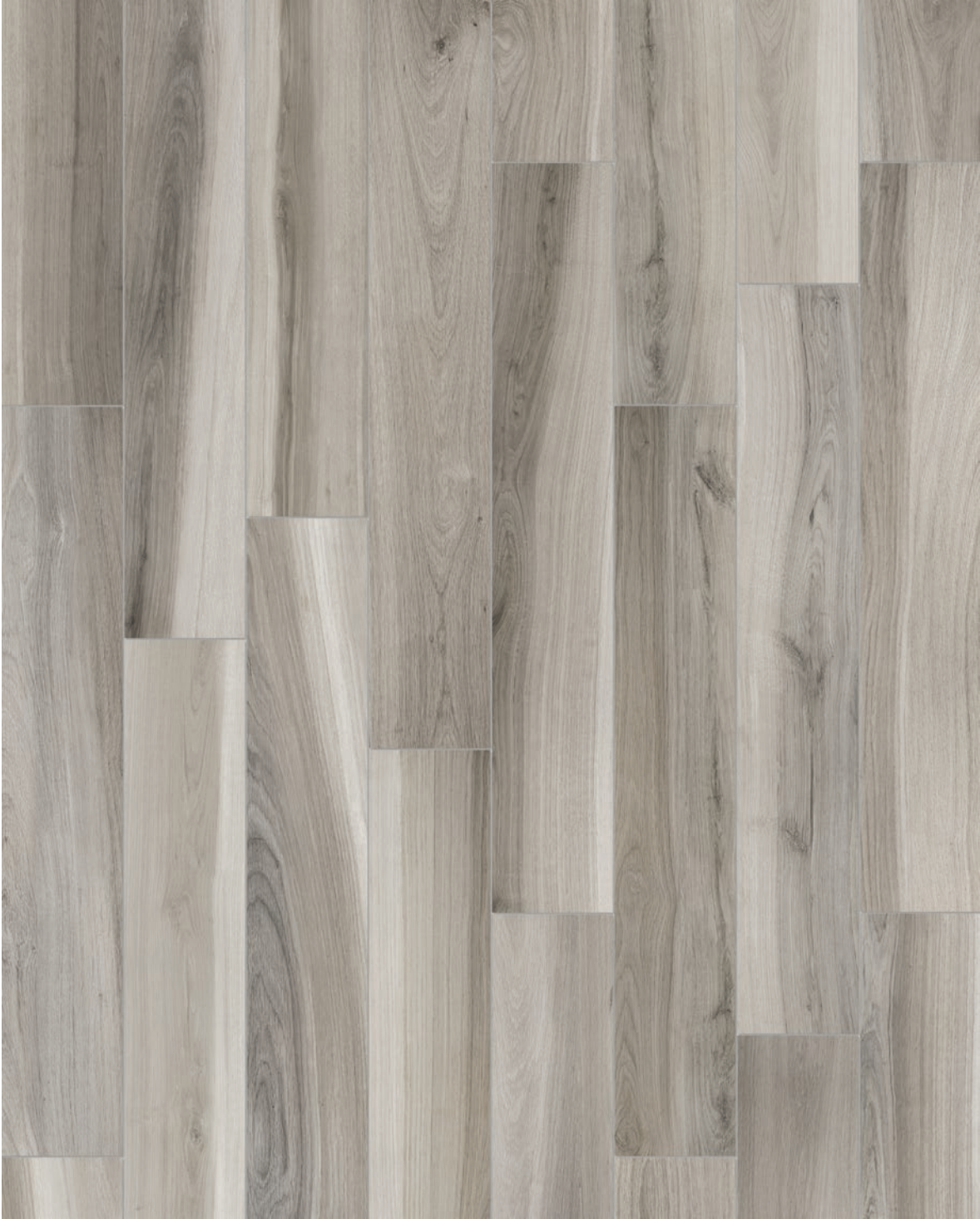
6" x 36" AMAYA WOOD ASH HD PORCELAIN TILE