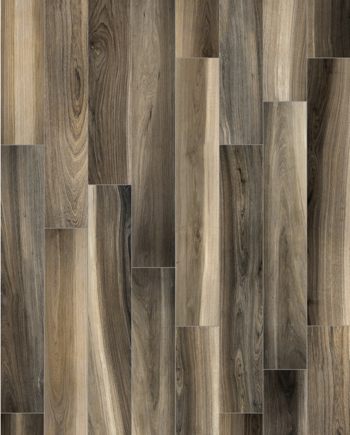
6" x 36" AMAYA WOOD TOBACCO HD PORCELAIN TILE