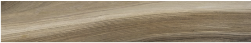
6" x 36" AMAYA WOOD WALNUT HD PORCELAIN TILE 62-733