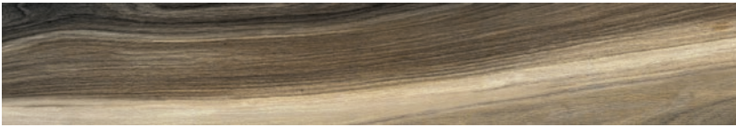
6" x 36" AMAYA WOOD TOBACCO HD PORCELAIN TILE 62-732