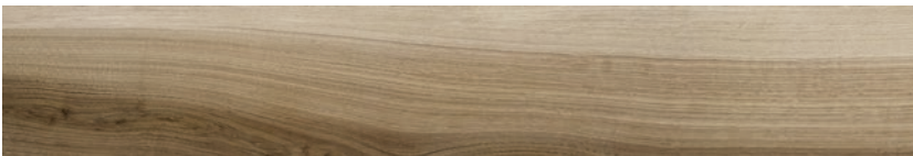
6" x 36" AMAYA WOOD NATURAL HD PORCELAIN TILE 62-903