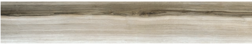
6" x 36" AMAYA WOOD BLEND HD PORCELAIN TILE 62-734