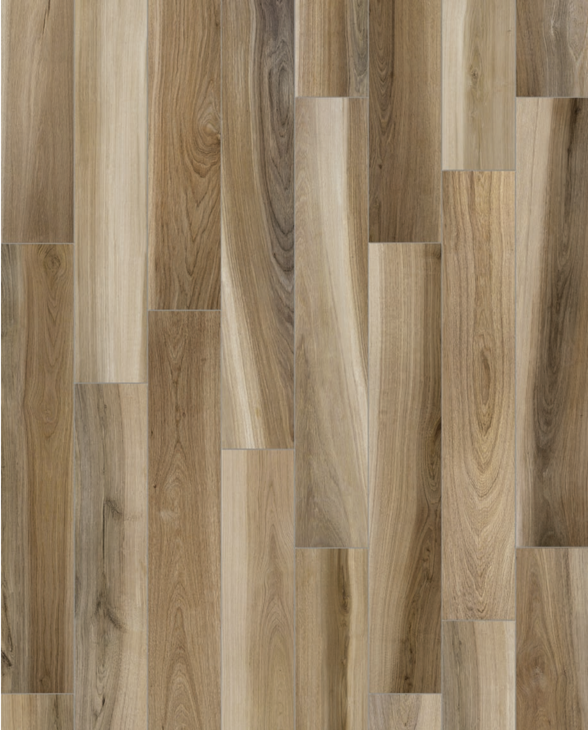
6" x 36" AMAYA WOOD NATURAL HD PORCELAIN TILE