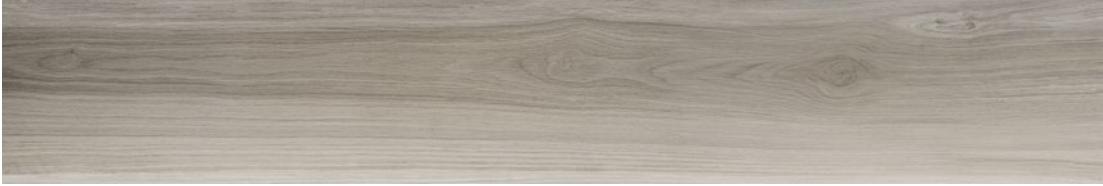
8" x 48" AMAYA WOOD ASH HD PORCELAIN TILE 62-904