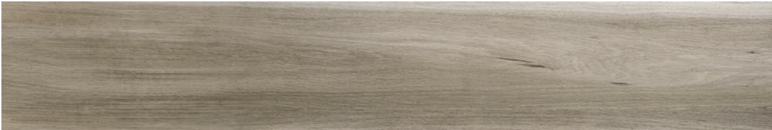
8" x 48" AMAYA WOOD BLEND HD PORCELAIN TILE 62-902