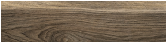
6" x 24" AMAYA WOOD TOBACCO HD PORCELAIN TILE 62-533