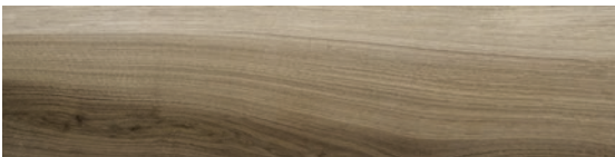
6" x 24" AMAYA WOOD WALNUT HD PORCELAIN TILE 62-534