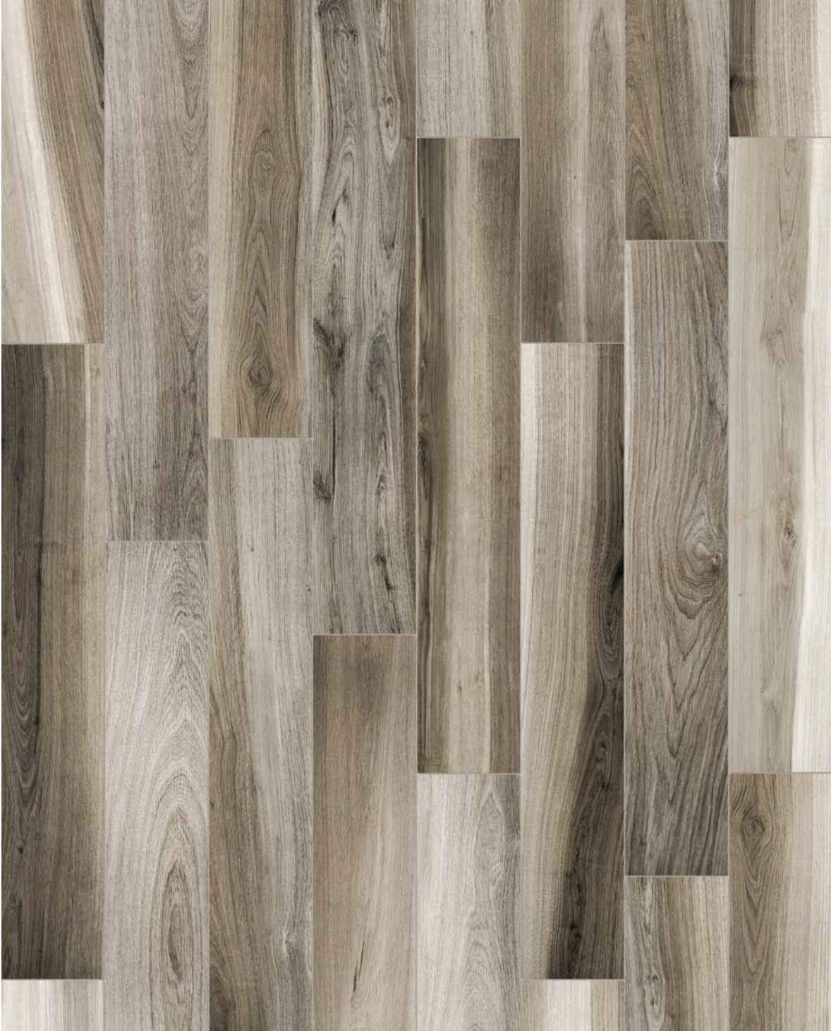
6" x 36" AMAYA WOOD BLEND HD PORCELAIN TILE