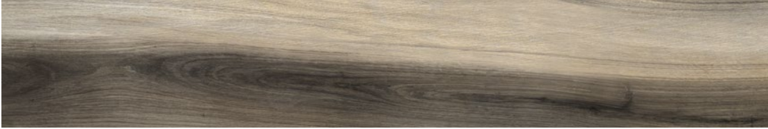
8" x 48" AMAYA WOOD TOBACCO HD PORCELAIN TILE 62-900