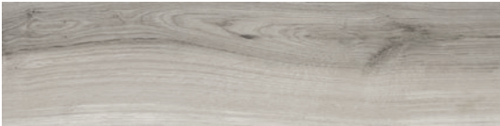
6" x 24" AMAYA WOOD ASH HD PORCELAIN TILE 62-537