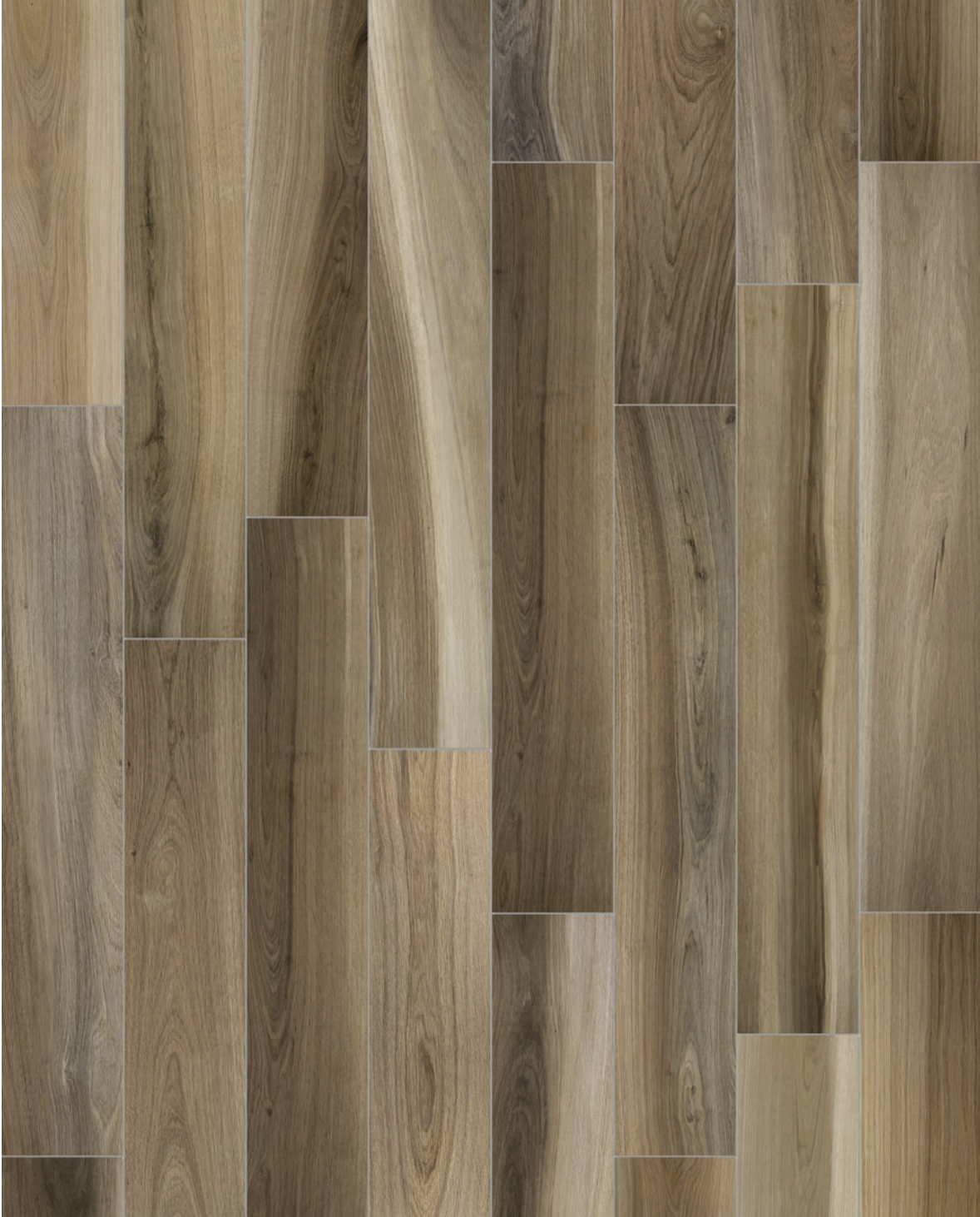
6" x 36" AMAYA WOOD WALNUT HD PORCELAIN TILE