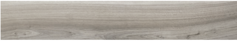
6" x 36" AMAYA WOOD ASH HD PORCELAIN TILE 62-736