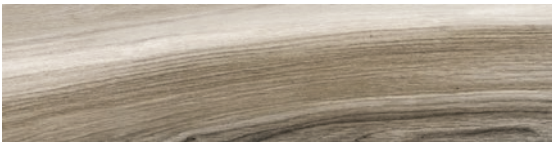
6" x 24" AMAYA WOOD BLEND HD PORCELAIN TILE 62-535