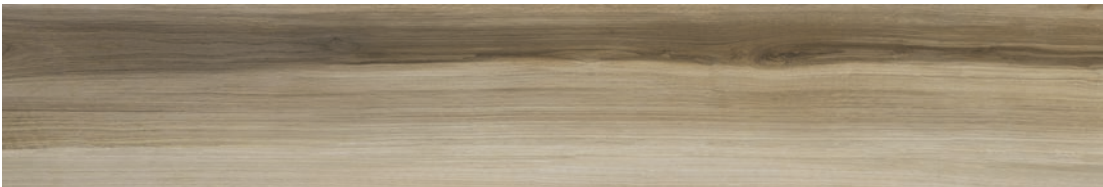
8" x 48" AMAYA WOOD WALNUT HD PORCELAIN TILE 62-901