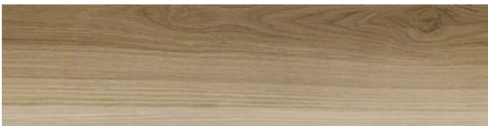
6" x 24" AMAYA WOOD NATURAL HD PORCELAIN TILE 62-536