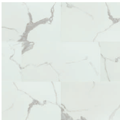
Calacatta Marbello LVT™