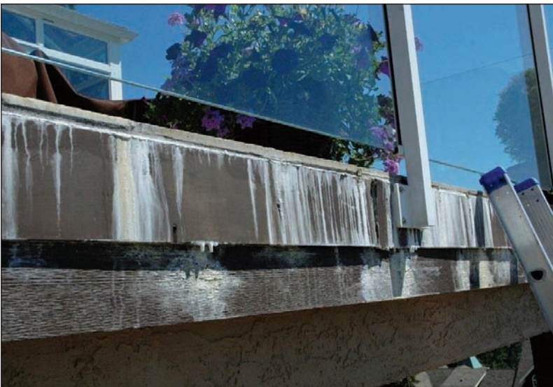
Inadequate moisture management can lead to efflorescence that destroys the appearance of the tile installation.

Another solution to consider is to use a topical waterproofing membrane meeting American National Standards Institute (ANSI) A118.10, Load-bearing, Bonded, Waterproof Membranes for Thin-set Ceramic Tile and Dimension Stone Installations , in combination with a drain that has an integrated bonding flange. This eliminates the need for a pre-slope since the waterproofing is atop the substrate. This assembly also reduces the overall height of the floor, and makes it easier to manage transitions at doorways and fixtures. Proper slope is extremely important for exterior decks where freeze and thaw conditions can play havoc if the water is not properly evacuated from the deck area.