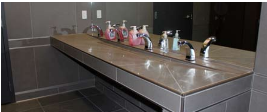
The finished vanity has a single basin that slopes gently to a linear drain for a sleek, modern look.

eter supports and bent along the relief cuts to slope toward the faucet supports. Finally, linear drains with integrated bonding flanges were set into the basins and connected to the waste lines.