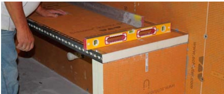
The entire sink and vanity was constructed using the Kerdi-Board building panel system so no wood or metal framing materials were used in these areas.

The walls are expected to support approximately 50% of the heating load in the warehouse with the other 50% coming from a solar wall and supplemental heaters if required.