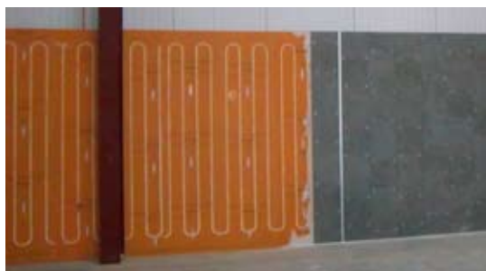
Radiant heated walls were built by installing hydronic tubing in foam board walls which were then covered with tile.

In total, the 8'-high walls span 775', covering an area of 6,200 square feet.