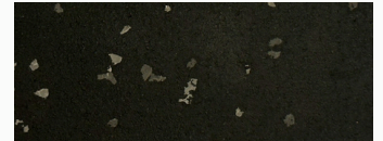
1402 VENOM GREY