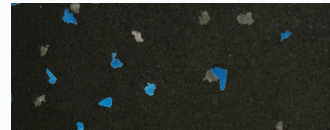
1403 VIVID BLUE