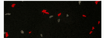
1404 VINO RED