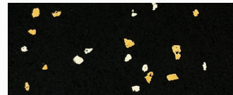
1405 VAPOR BEIGE