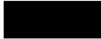
1401 VEX BLACK