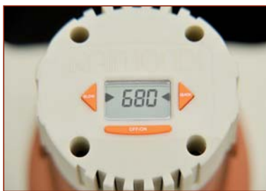
Mixers "Digital mixer" (with digital display).