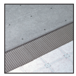
Installation over existing vinyl floor