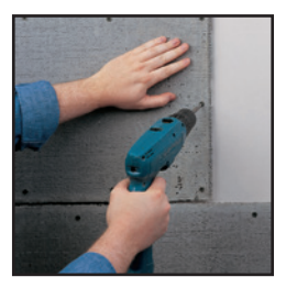
Fasten to studs