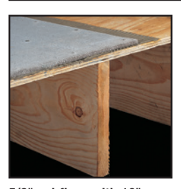
5/8" subfloor with 16" on center framing