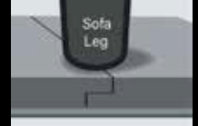
Flooring over Whisper Step®

Lays flat and helps mask minor subfloor irregularities; can be used above and below grade.