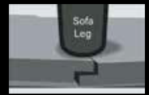
Flooring over lightweight underlayment