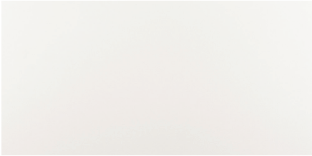
Domino White 12\"/>