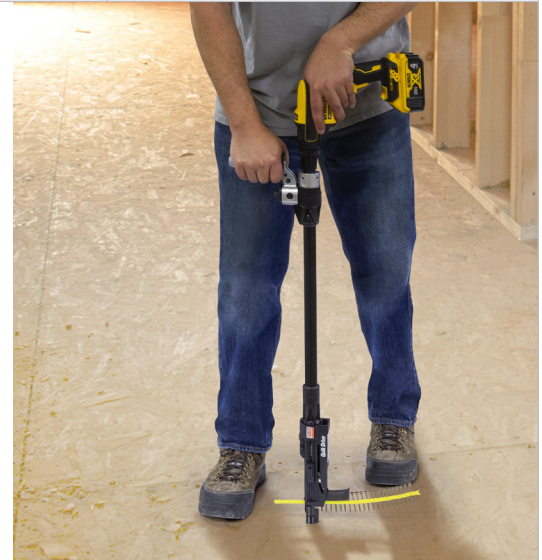
The cordless PRO250G2 Subfloor System with DeWalt driver motor