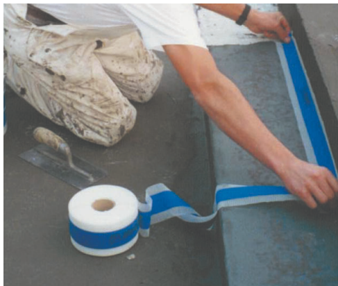
Waterproofing a corner between the bottom and a side of a bathtub