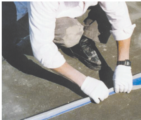
Waterproofing a structural joint on a terrace