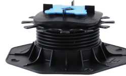
TSL-L 58/75 mm