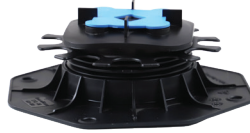
TSL-M 43/60 mm