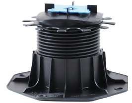
TSL-XL 75/120 mm

TerraMaxx® TSL-XS 26/36 mm (no leveling head)