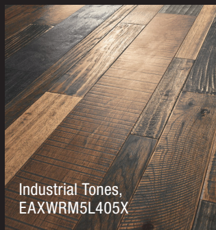
Industrial Tones, EAXWRM5L405X

Tell your style story confidently with the one-of-a-kind look of Woodland Relics. Your floor becomes the focal point – whether featured against the simple lines of an industrial loft or balanced with casual tones of a modern coastal cottage.