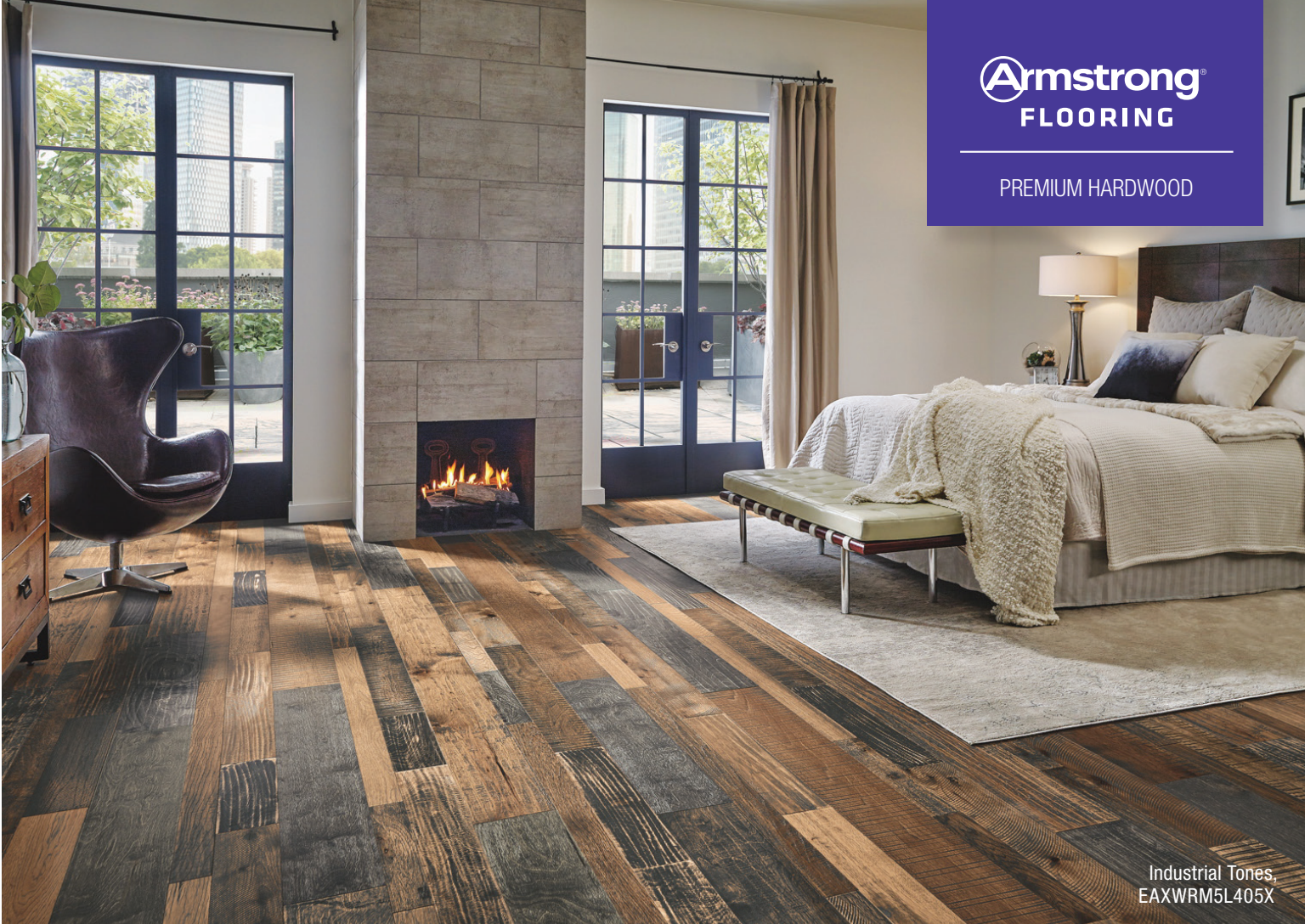
Industrial Tones, EAXWRM5L405X