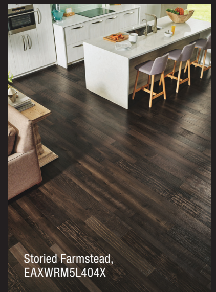
Storied Farmstead, EAXWRM5L404X

Visit us online at www.armstrongflooring.com/PremiumHardwood for Installation Tips | Room Visualizer | Style and Design Suggestions | Product Videos