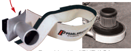
Dust Vac Kit #BUFVAC1