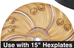
Use with 15" Hexplates