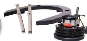
Horseshoe Weight 14 lbs. #HEX14LBS and Post #HP02PIN

For more information on Pearl Abrasive Company products, please contact: