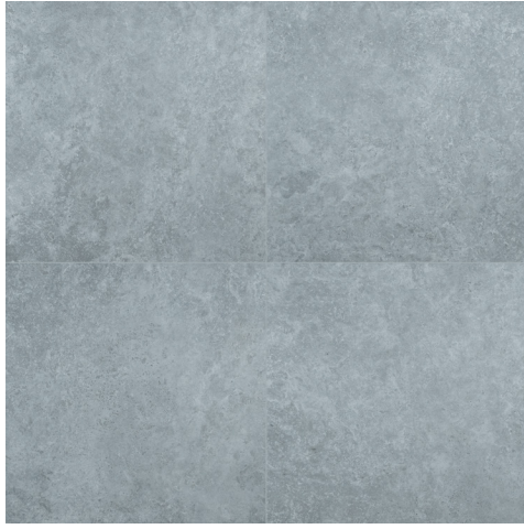
Lunar Silver 24"x24"