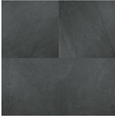
Montauk Black 24"x24"