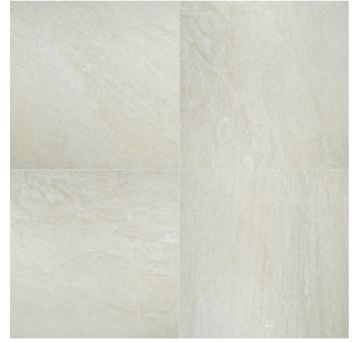
Quartz White 24"x24"