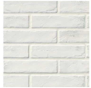
White Brick 2"x10"