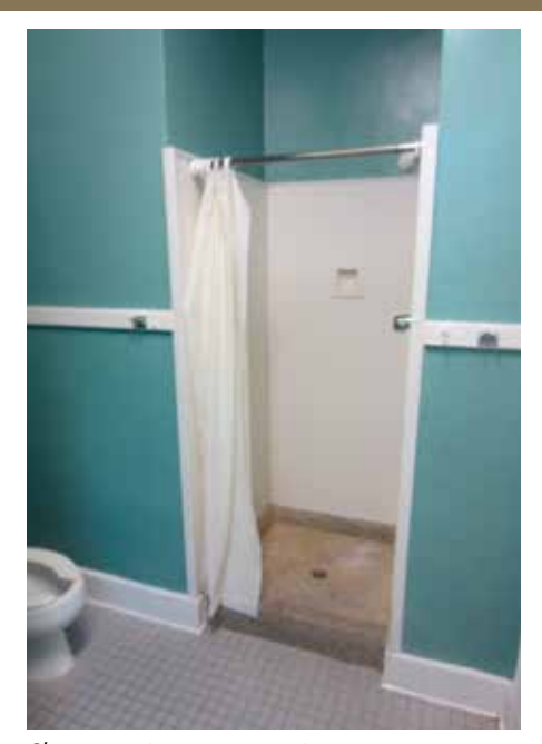
Shower prior to renovation

The existing showers, constructed using the traditional pan-liner