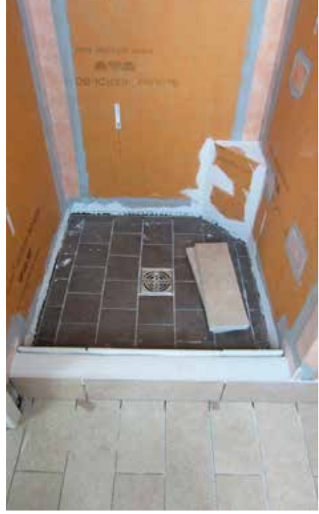
Setting tile with profiles.