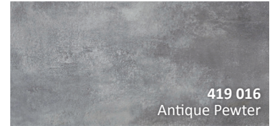
419 016 Antique Pewter