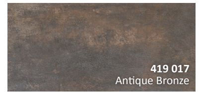
419 017 Antique Bronze