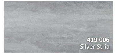
419 006 Silver Stria