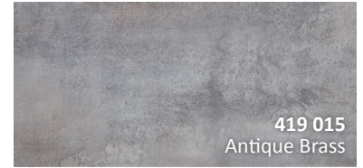
419 015 Antique Brass