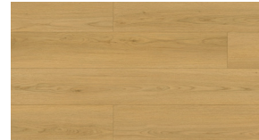
Clam Shell Oak