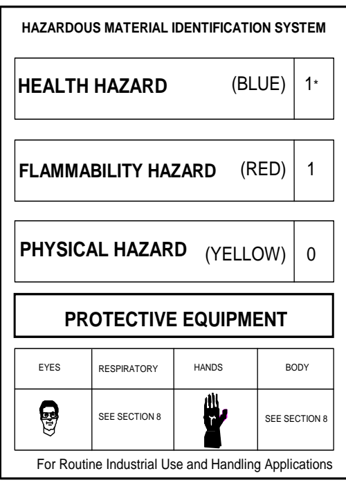
Hazard Scale: 0 = Minimal 1 = Slight 2 = Moderate 3 = Serious 4 = Severe * = Chronic hazard