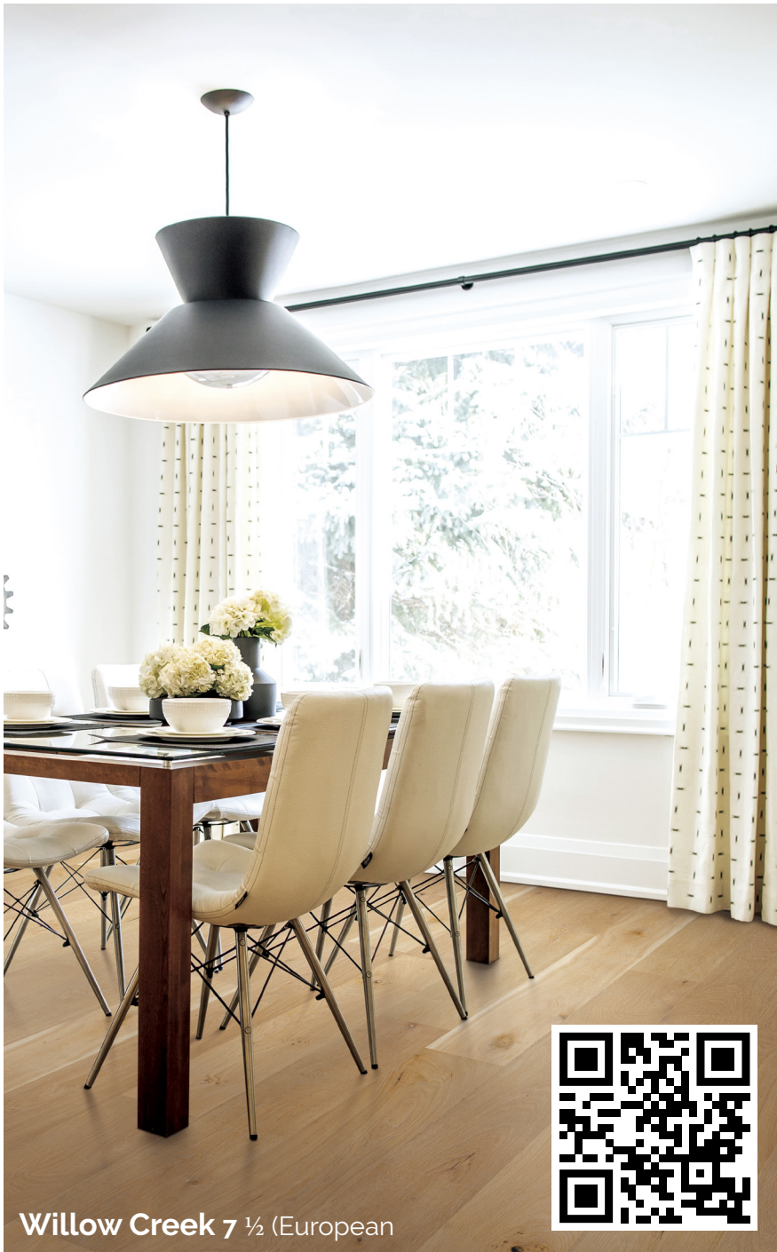
Willow Creek 7 ½" (European