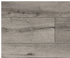
Silver Plated Oak