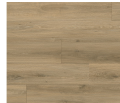
Monsoon Coast (*)