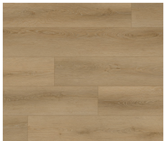
Sea Storm Oak