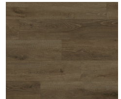
Coral Reef (*)