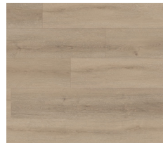
Tropic Gale (*)