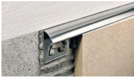
POLISHED STAINLESS STEEL AISI 304/1.4301-V2A with protective film bar length 2,7 lm - pack. 20 Pcs - 54 lm - 10/10 mm

POLISHED, SUPER POLISHED, SANDED AND SATIN FINISH STAINLESS STEEL AISI 304/1.4301-V2A