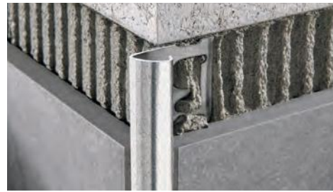
SATIN FINISH STAINLESS ST. AISI 304/1.4301-V2A with protective film bar length 2,7 lm - pack. 20 Pcs - 54 lm - 10/10 mm