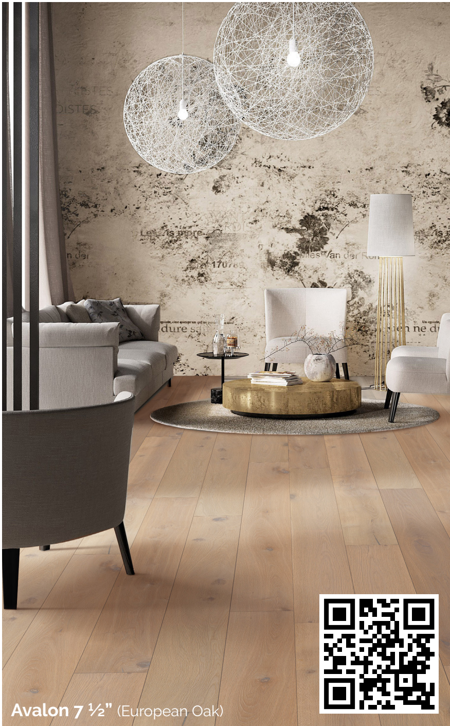
Avalon 7 1/2" (European Oak)