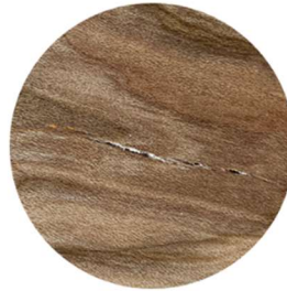
Splits and checks