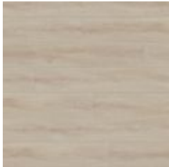
#8051 (Plank) Alboro Embossed