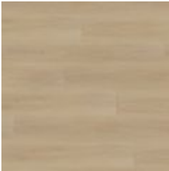
#8087 (Plank) Hermine Xtra Embossed