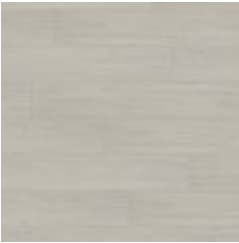
#8080 (Plank) Agostino Xtra Embossed