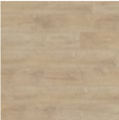
#8085 (Plank) Gaelic Xtra Embossed