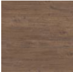
#8091 (Plank) Vaporetti Xtra Embossed