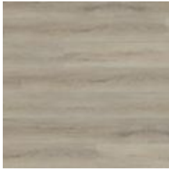
#8083 (Plank) Arzon Xtra Embossed