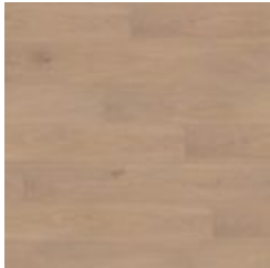
#8086 (Plank) Gondola Xtra Embossed