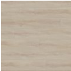
#8081 (Plank) Alboro Xtra Embossed