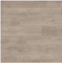
#8082 (Plank) Armoric Xtra Embossed