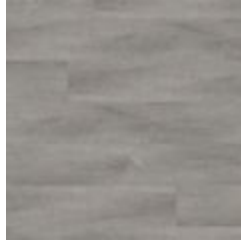
#1722 (Plank) Carson Embossed