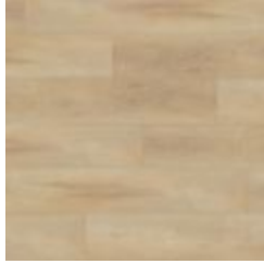
#1721 (Plank) Anning Embossed