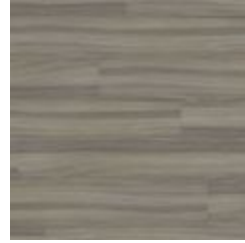
#1723 (Plank) Edison Embossed