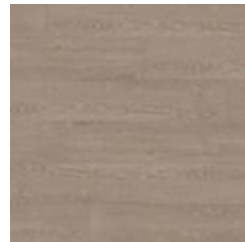
#1728 (Plank) Hodgkin Embossed