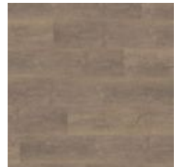
#1729 (Plank) Hopper Embossed