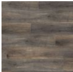
#1731 (Plank) Wallace Embossed