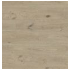
#1727 (Plank) Hawking Embossed