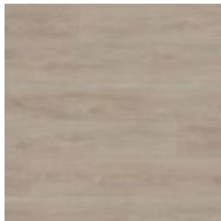
#1726 (Plank) Gutenberg Embossed