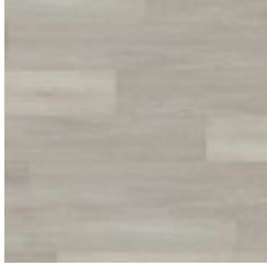
#1720 (Plank) Anderson Embossed