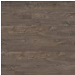
#1730 (Plank) Johnson Embossed