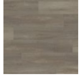
#1724 (Plank) Franklin Embossed