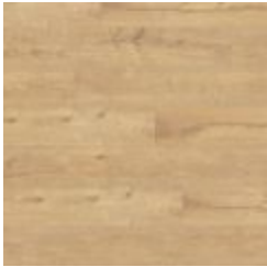
#1449 (Plank) Nautilus Registered Embossed