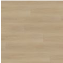
#1448 (Plank) Loch Registered Embossed