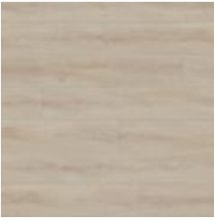
#1445 (Plank) Abyssal Registered Embossed