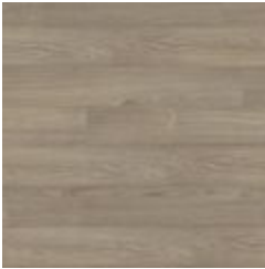
#1447 (Plank) Cormorant Registered Embossed