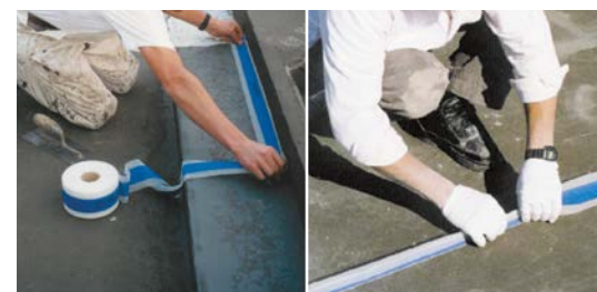
An example of Mapeband waterproofing a corner between the bottom and a side of a bathtub

MAPEI's Reinforcing Fabric or Fiberglass Mesh may be required (or optional) when waterproofing the main area. Therefore, in order to finish waterproofing the remaining area (floors or walls), see instructions on the packaging or TDS for the specific type of MAPEI waterproofing being installed.