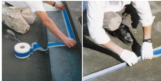
An example of Mapeband waterproofing a corner between the bottom and a side of a bathtub

MAPEI's Reinforcing Fabric or Fiberglass Mesh may be required (or optional) when waterproofing the main area. Therefore, in order to finish waterproofing the remaining area (floors or walls), see instructions on the packaging or TDS for the specific type of MAPEI waterproofing being installed.