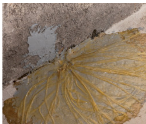
Impregnating MapeWrap FIOCCO