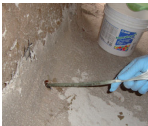
Inserting MapeWrap FIOCCO in the hole