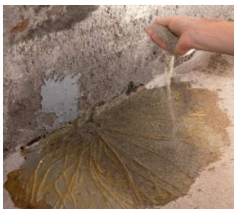
Broadcast with quartz sand