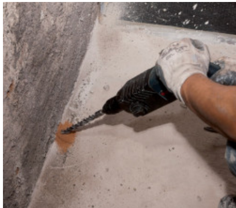
Drilling the hole

The products mentioned above form an efficient barrier against UV rays, which make them particularly recommended for structures exposed to direct sunlight.