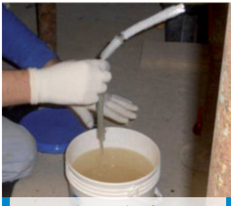
Impregnating a portion of MapeWrap FIOCCO