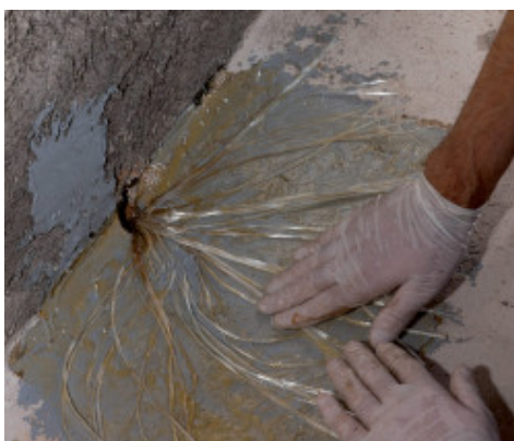
The splayed end of a piece of MapeWrap FIOCCO