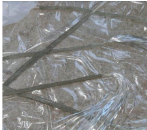
Curing for 24 hours