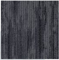
#04 Black Mirror