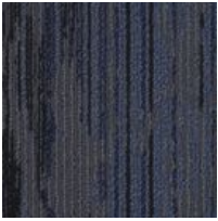
#06 Bright Nova