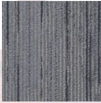
#02 Streaky Grey