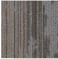
#01 Light Stream