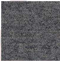
#02 Silver Confetti