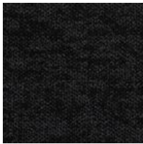
#06 Dark Alley