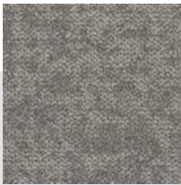
#03 Light Snowstorm