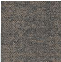
#04 Natural Pathway