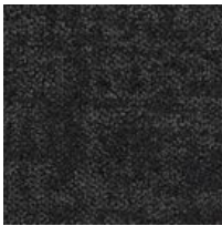
#05 Night Stone