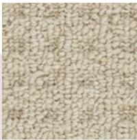
#16384 Maple Cream