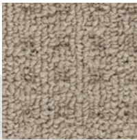
#17060 Maple Wood