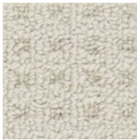
#14232 Polar Bear