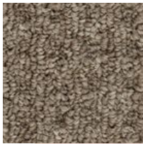
#73748 Bistre Brown