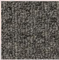
#84200 Ravine Grey