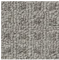
#86886 Windsor Grey