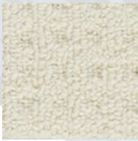
#17057 Tender Ivory