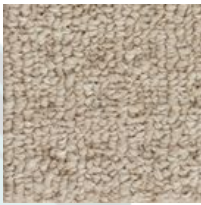
#14729 Tender Taupe