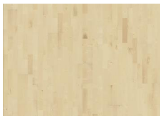
European Maple Gotha