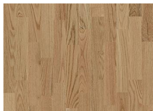
Red Oak Nature