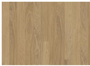
Coconut Cream Wide