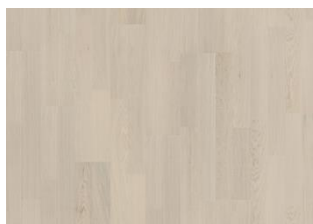
Coconut Cream 2-strip