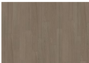
Earl Grey Narrow