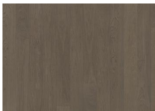
Faded Black Wide