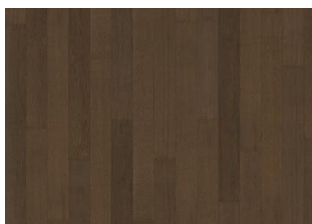
Cocoa Bean Narrow