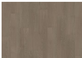
Earl Grey 2-strip