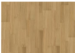
Pure Oak 2-strip