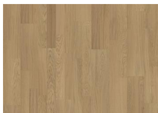
Light Suede 2-strip