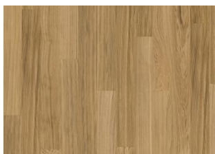
Pure Oak Wide