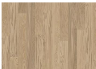
Whole Grain Wide