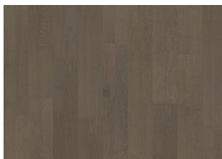
Faded Black 2-strip