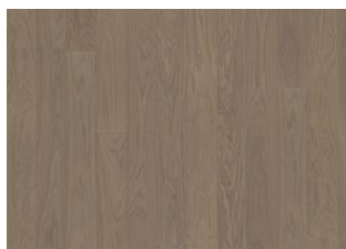
Earl Grey Wide