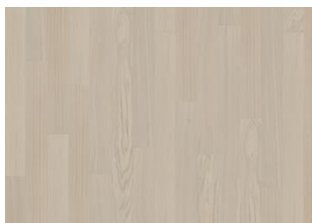
Coconut Cream Narrow