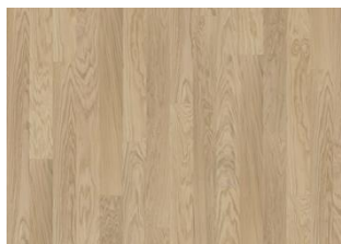
Whole Grain Narrow