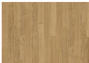
Pure Oak Narrow