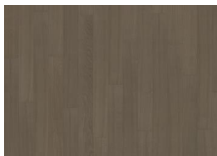
Faded Black Narrow