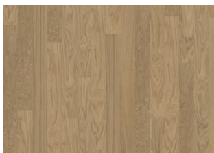
Light Suede Narrow