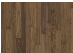
Pure Walnut Narrow