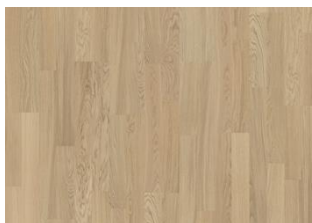
Whole Grain 2-strip