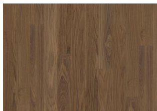
Pure Walnut Wide