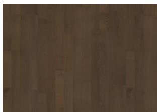
Cocoa Bean 2-strip