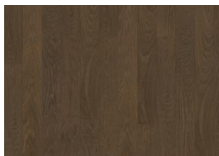
Cocoa Bean Wide