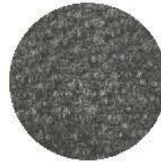
Colour: Grey Code: PN60325 Cut: PN60325CUT