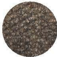
Colour: Beige Code: PN60315 Cut: PN60315CUT