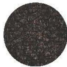
Colour: Chocolate Code: PN60310 Cut: PN60310CUT