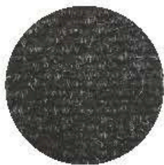
Colour: Charcoal Code PN60320 Cut: PN60320CUT