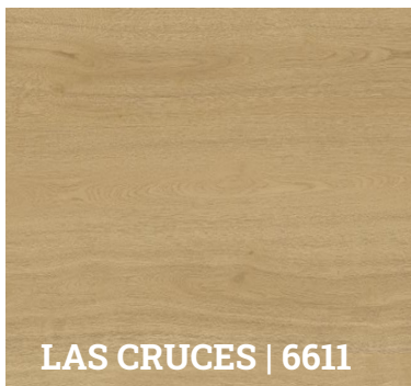
LAS CRUCES | 6611