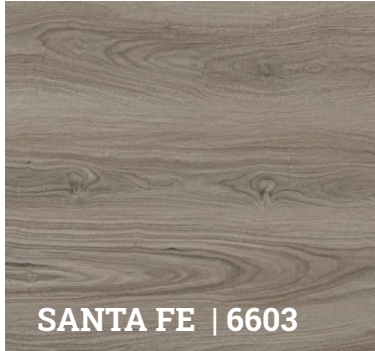
SANTA FE | 6603