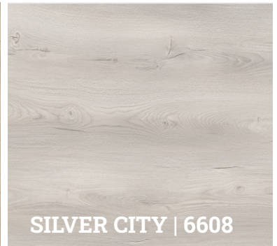
SILVER CITY | 6608