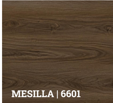
MESILLA | 6601