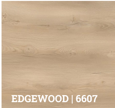
EDGEWOOD | 6607