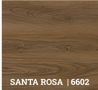
SANTA ROSA | 6602