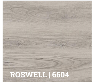
ROSWELL | 6604