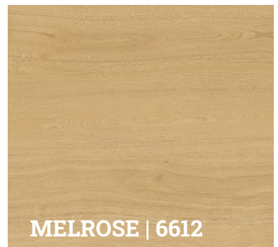
MELROSE | 6612