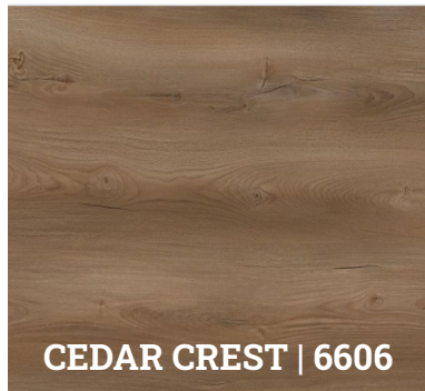
CEDAR CREST | 6606