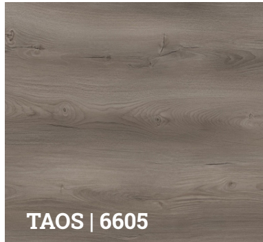
TAOS | 6605