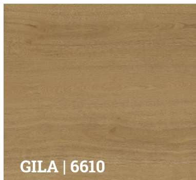
GILA | 6610