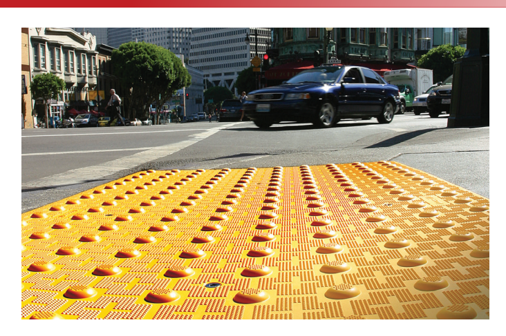
Tactile Walking Surface Indicator (TWSI) with Truncated Domes