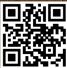
Arctic Acorn (Oak)

Immerse yourself in the tranquil elegance of the Nordic Lights collection, blending the robust beauty of oak and hickory with the clean aesthetics of Scandinavian design. Each intricately engineered 7 1/2" plank is finished beautifully with a subtle wirebrushed texture. This collection's serene beauty is an everlasting foundation for your home.