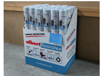
available in retail boxes