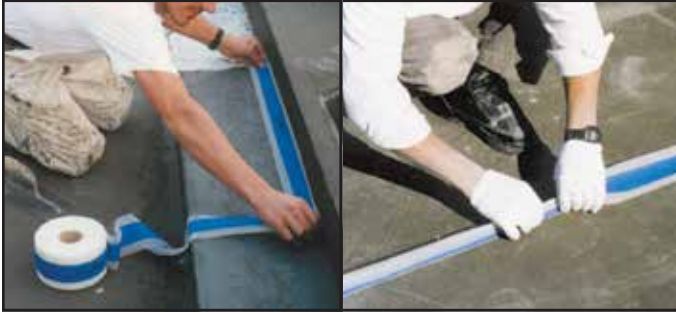
An example of Mapeband waterproofing a corner between the bottom and a side of a bathtub

MAPEI's Reinforcing Fabric or Fiberglass Mesh may be required (or optional) when waterproofing the main area. Therefore, in order to finish waterproofing the remaining area (floors or walls), see instructions on the packaging or TDS for the specific type of MAPEI waterproofing being installed.