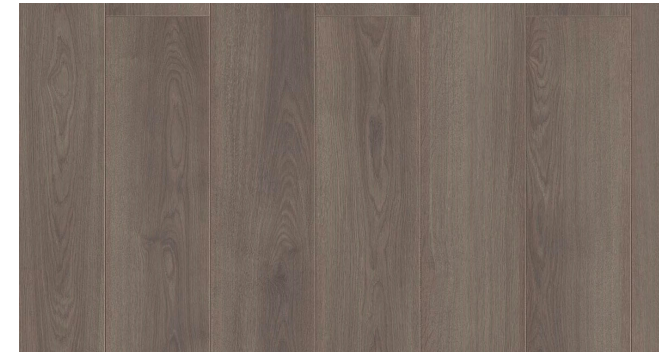
IH56357 | Nelson