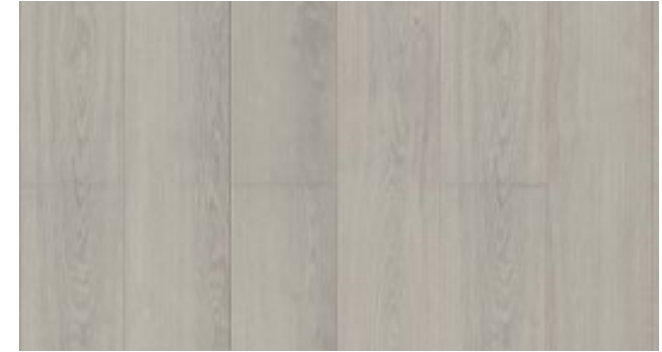
IH56350 | Bunbury