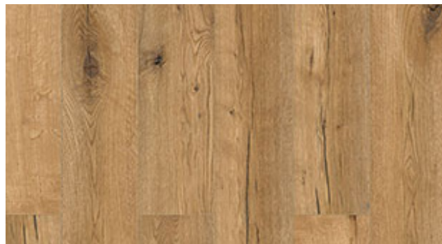
IH56359 | White Oak