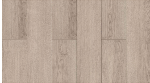
IH56347 | Adelaide