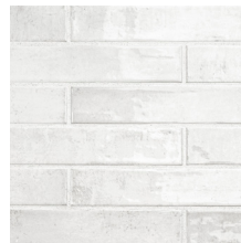
LA PERLA NSTELAPEA2X10G