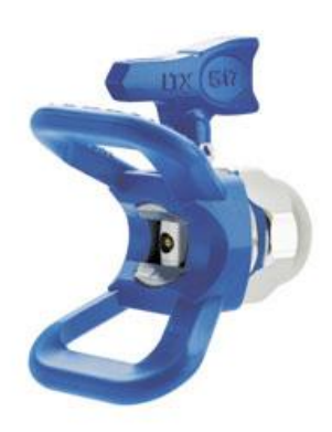
Typical LTX Sprayer Nozzle

Tip Size: LTX521 – has an orifice of 0.021" (0.5mm) and a fan width of 10" (250 mm) holding the nozzle 12" (300 mm) away from the substrate.