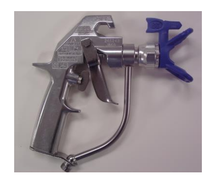
Silver Gun Plus

Follow the specific airless sprayer and spray gun manufacturer's written instructions when using their specific equipment. The Graco Silver Gun Plus<sup>®</sup> is depicted in the following photo. This spray gun can be used for both vertical and horizontal applications. Some Spray Guns will allow filtering in the gun handle. The filters will need to be periodically cleaned and changed to ensure proper liquid flow through the spray gun and tip.